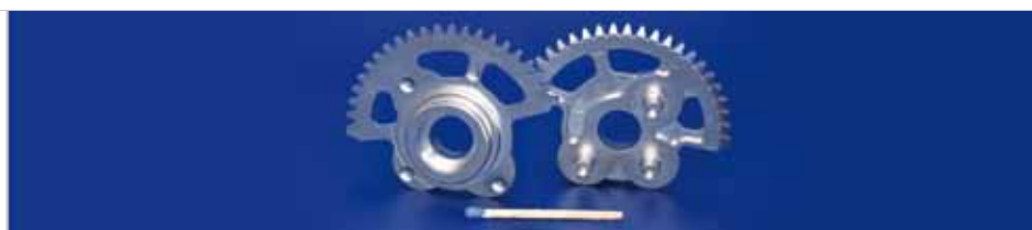
Drive gear for sunroof (Automotive) Steel 1.6546, coated Weight 93.6 g