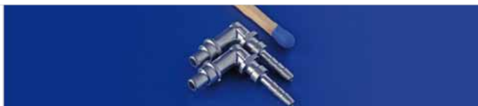
Hydraulic connector (Automotive) Stainless steel 316 L Weight 2.25 g