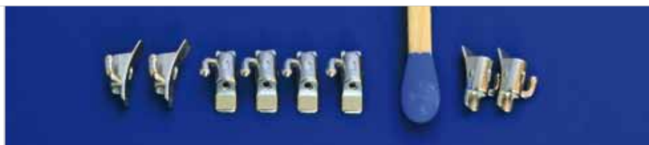
Flat-line buccal tube (Medical / dental) Nickel-free stainless steel 1.4456 Weight 0.11 g