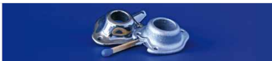
Port system for catheter (Medical) TiAl6V4 Weight 6.33 g